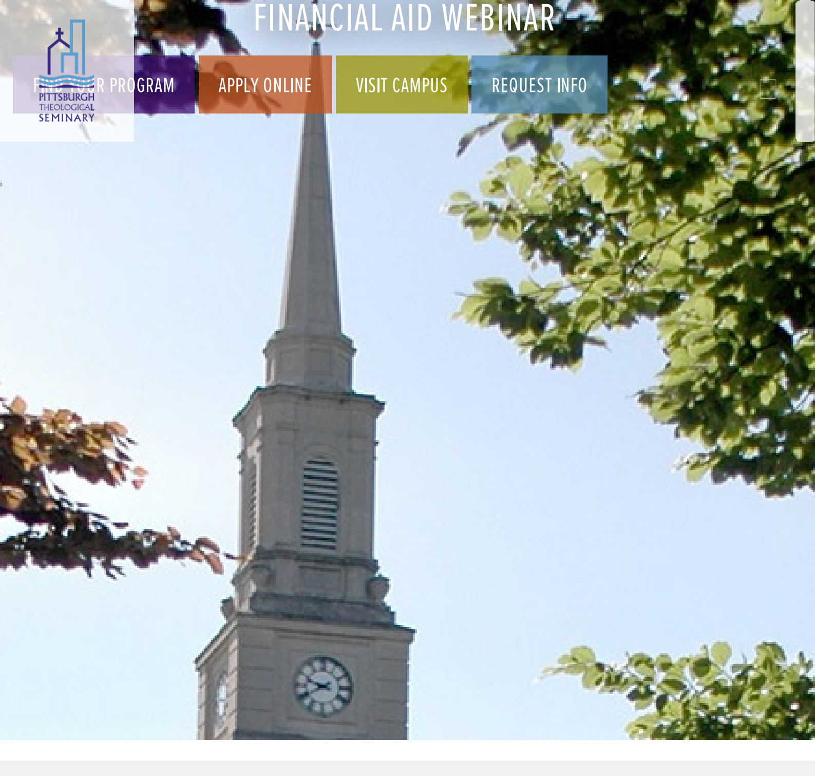
FINANCIAL AID WEBINAR